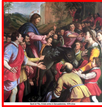
Stefano di Tito, Cristo entra in Gerusalemme, 1570 circa