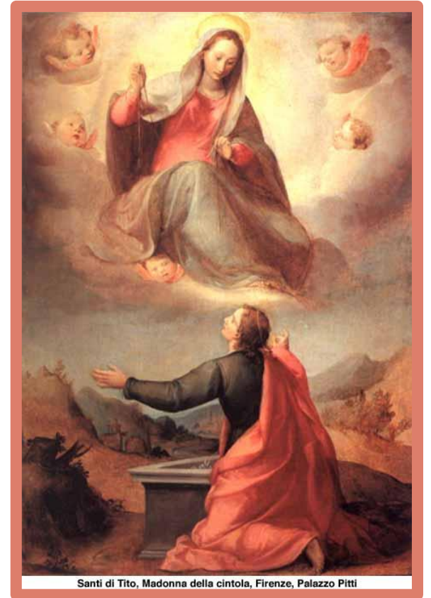
Santi di Tito, Madonna della cintola, Firenze, Palazzo Pitti