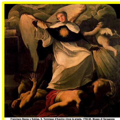
Francisco Bayeu y Subias, S. Tommaso d'Aquino vince la eresia, 1799-40, Museo di Garagoza

O Merciful God, grant that I may ever perfectly do Thy Will in all things. Let it be my ambition to work only for Thy honour and glory.