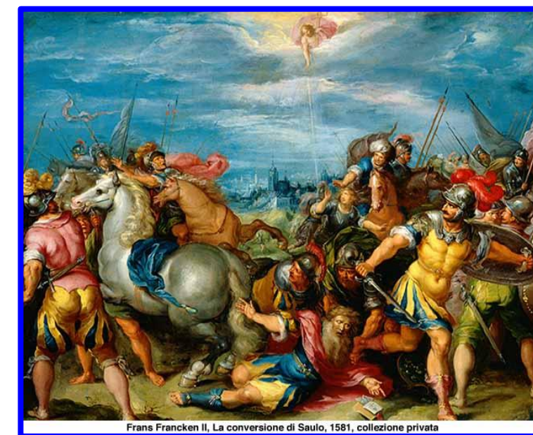
Frans Francken II, La conversione di Saulo, 1581, collezione privata

As we celebrate the Feast of the Conversion of St. Paul, in which St. Stephen had a major part at his martyrdom, and week of Prayer for Christian Unity, let us pray for the conversion of all to the Holy Catholic Faith and the return of those who are in Schism.