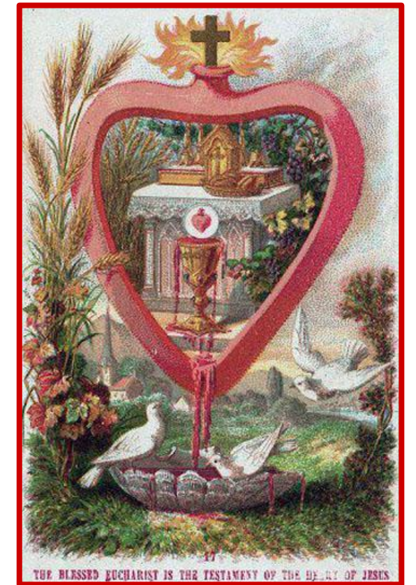
THE BLESSED EUCHARIST IS THE TESTAMENT OF THE HEART OF JESUS