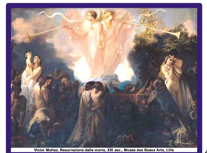
Victor Mottez, Resurrezione dalla morte, XIX sec., Musée des Beaux Arts, Lille